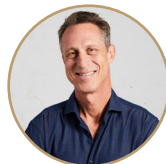
Mark Hyman , MD, Founder & Senior Advisor: Cleveland Clinic for Functional Medicine