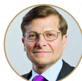
Michael Roizen , MD, FACP, Chief Wellness Officer Emeritus, Cleveland Clinic, Professor, Cleveland Clinic Lerner College of Medicine at Case Western Reserve University, Chief Visionary, LongevityPlaybook.com