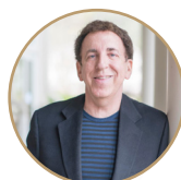
Dean Ornish , MD, Founder & CEO, Ornish Lifestyle Medicine