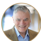
Leroy Hood MD , PhD, Professor and Chief Innovation Officer at the Buck Institute and CEO of Phenome Health