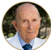
Kenneth H. Cooper , MD, MPH, Founder and Chairman, Cooper Aerobics

We express our appreciation to the experts who participated in the Longevity Clinics Roundtable Conference, listed alphabetically: